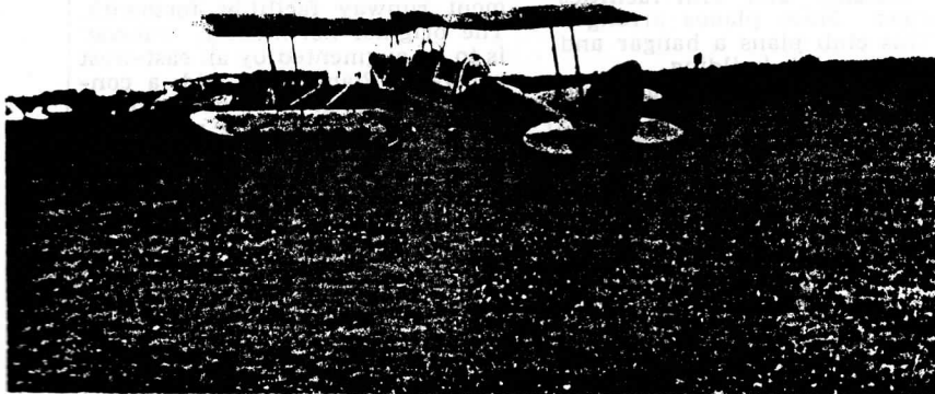
DOT Aircraft, Stagger Wing Beech at Cassidy Airport 1946

Actual training will be started early in the new year, and at the same time will be launched a strong drive among all the known "air-minded" progressives of this community, to build up the present membership standing. Preliminary membership efforts have proven so encouraging that the club is now convinced that a very strong local organization will be developed. Plans are afoot for suitable hangar accommodations which are expected to be in preparedness by the time the two initial trainers arrive.